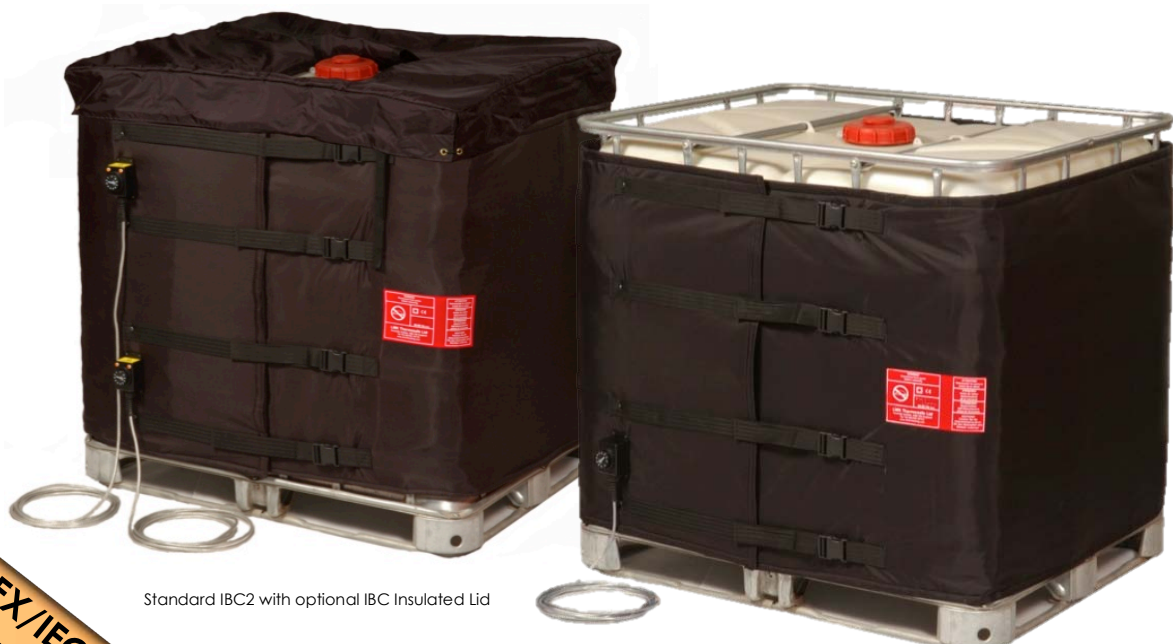
Standard IBC2 with optional IBC Insulated Lid