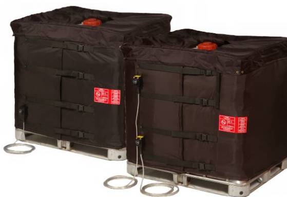
IBC1 and IBC2 Heating Jackets with optional Insulated Lids